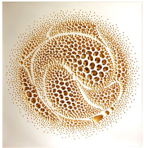
Kim Jae Il Vestige (Earth) , 2014 - Vestige Series acrylic on fiberglass resin 39 x 37 in