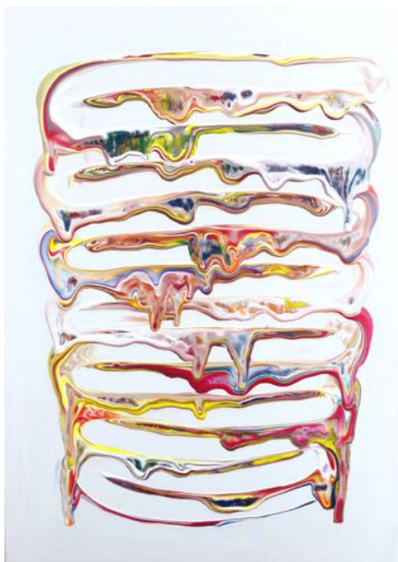
Derick Smith Untitled (on white) , 2016 acrylic on canvas 28 x 20 in