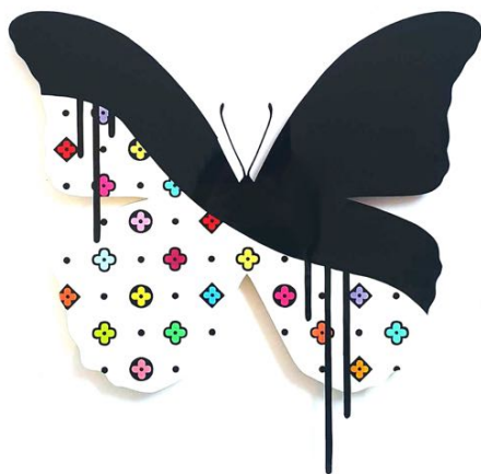
VeeBee Butterflies Never Shatter , 2015 spray paint and stencil on glass 17.5 x 17.5 in