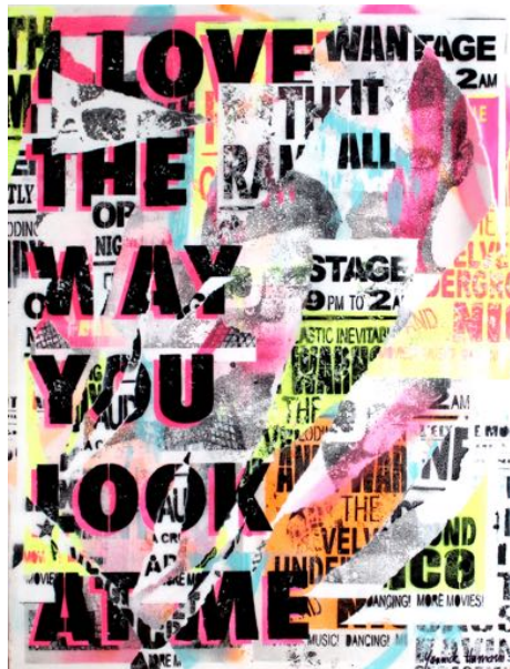
Yannick Hamon I Love the Way You Look at Me , 2016 stencil, spray, resin on canvas 40 x 30 in